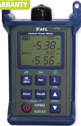
OPM5 Optical Power Meter