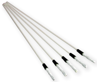
Type 2.5 mm