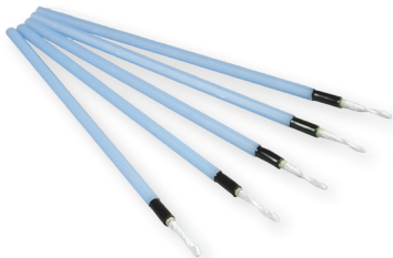
Type 1.25 mm